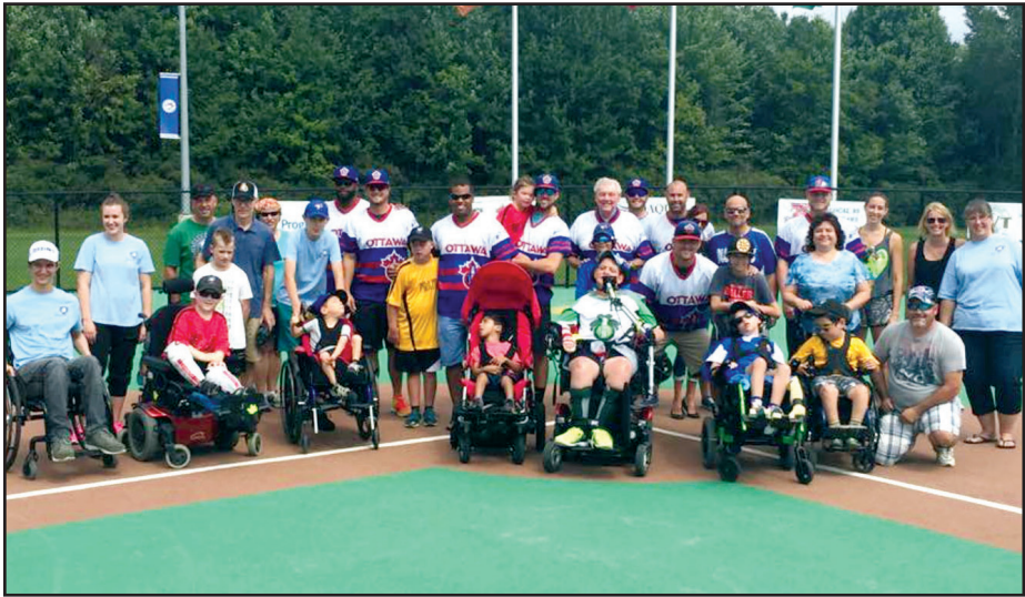
The Miracle League of Ottawa is just of the many organizations that has benefited from the Friends of the Mer Bleue's community improvement program over the years.

The organization also grants $4,000 a year to a number of community associations in the area including the Navan Community Association, the Chapel Hill South Community Association, the Bradley Estates Community Association and the Blackburn Community Association.